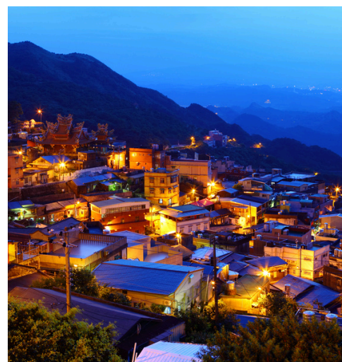
Taipei JIU FEN 九份

For reservations or any other inquiries, please contact our staff.