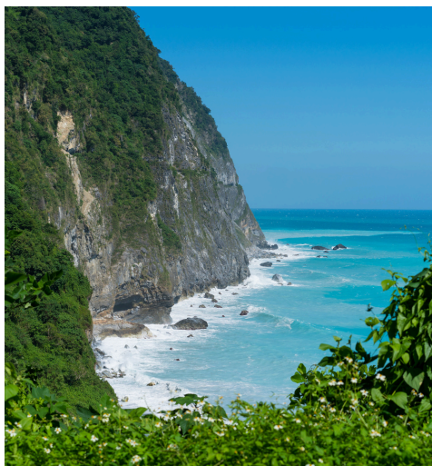
Taitung QINGSHUI CLIFF 清水断崖