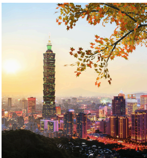
Taipei TAIPEI 101 台北 101