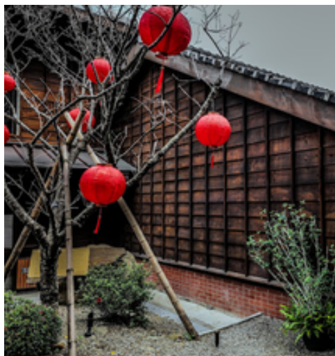
Taipei RONGJIN GORGEOUS TIME 锦榕时光生活园区