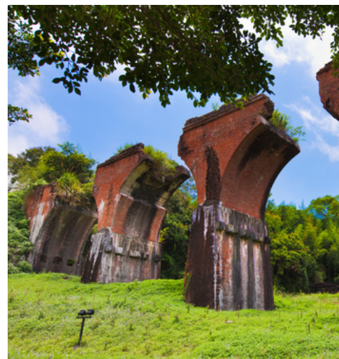
Taipei LONGTENG BRIDGE 龙腾断桥