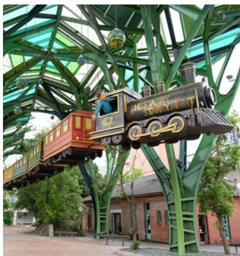
Yilan JIMMY PARK 几米公园