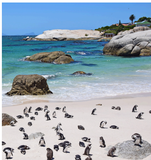
Cape Peninsula, South Africa BOULDERS BEACH 博尔德斯海滩