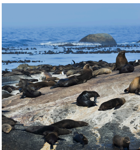
Cape Town, South Africa SEAL ISLAND 海豹岛