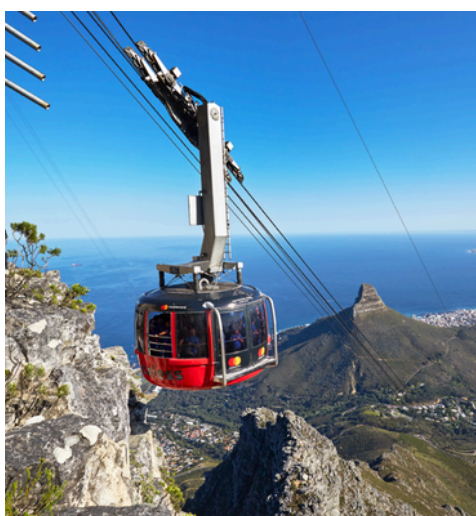
Cape Town, South Africa TABLE MOUNTAIN 桌山