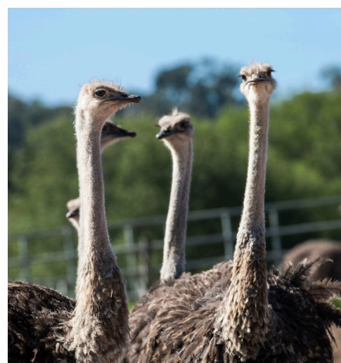
Cape Peninsula, South Africa OSTRICH RANCH 鸵鸟牧场

For reservations or any other inquiries, please contact our staff.