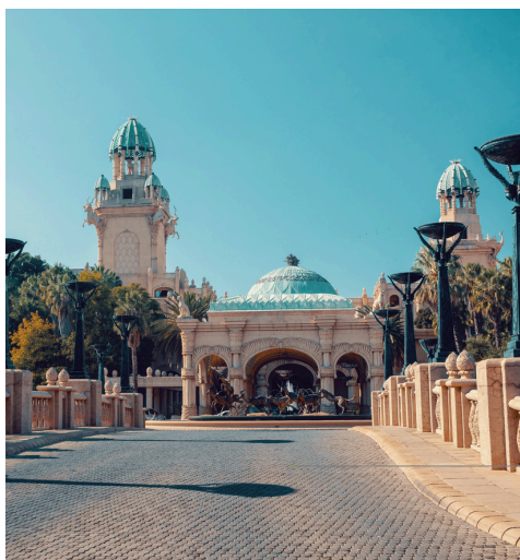
Sun City, South Africa SUN CITY 太阳城