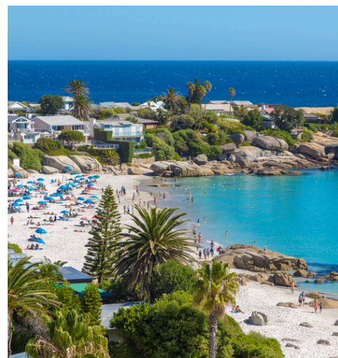
Cape Peninsula, South Africa CAMPS BAY 坎普斯湾