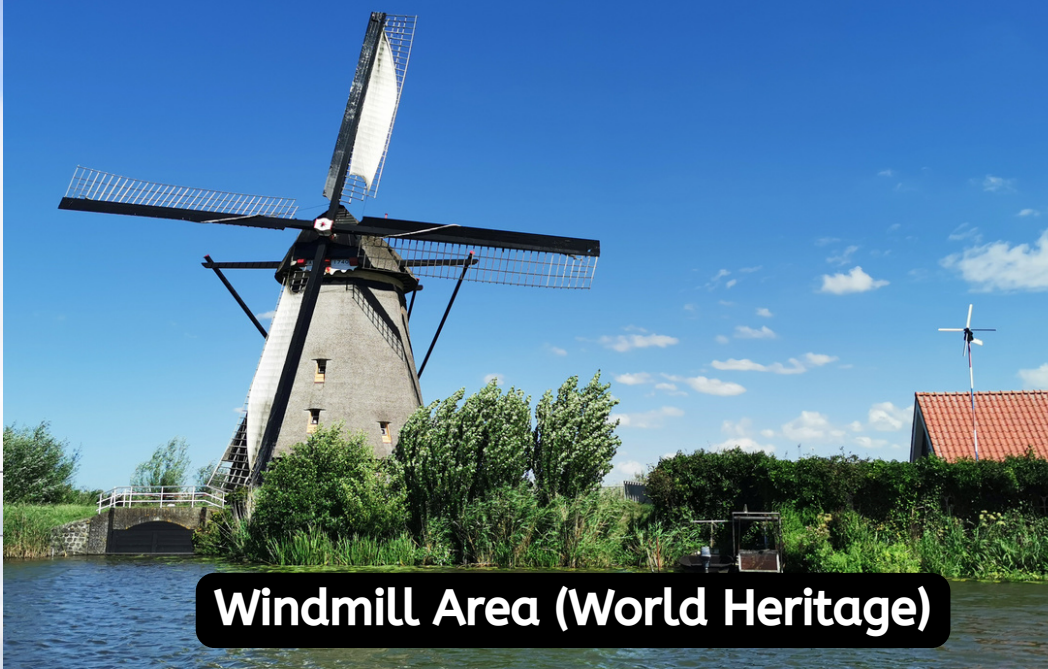
Windmill Area (World Heritage)