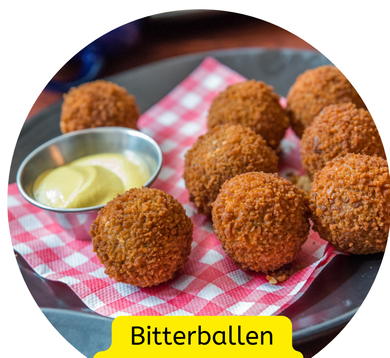
Bitterballen Dinner Inclusive