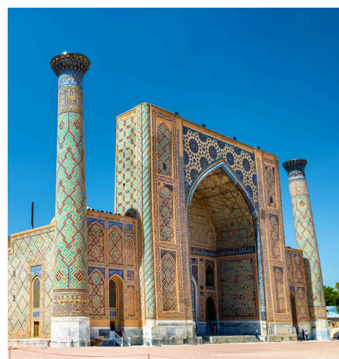
Samarkand, Uzbekistan REGISTAN SQUARE 雷吉斯坦广场

For reservations or any other inquiries, please contact our staff.