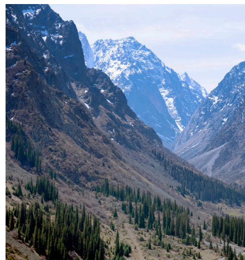
Ala Archa, Kyrgyzstan ALA ARCHA GORGE 阿拉尔恰峡谷