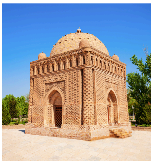
Bukhara, Uzbekistan SAMANIDS MAUSOLEUM 萨曼尼王朝陵墓