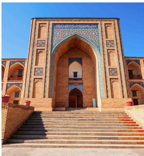
Tashkent, Uzbekistan KUKALDASH MADRASAH 库卡尔达什麦德雷萨