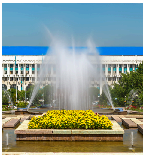
Almaty, Kazakhstan REPUBLIC SQUARE 共和国广场