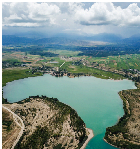
Kazakhstan ISSYK LAKE 伊塞克湖