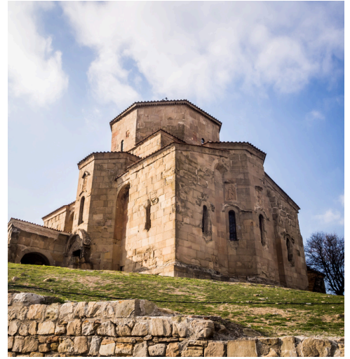
Mtskheta, Georgia JVARI MONASTERY 贾尔维修道院