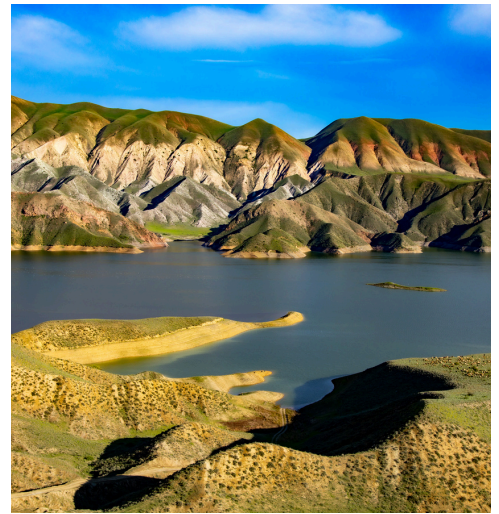
Armenia AZAT RIVER 阿扎特河

For reservations or any other inquiries, please contact our staff.