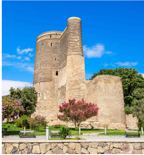
Baku, Azerbaijan MAIDEN TOWER 少女塔