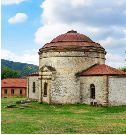
Sheki, Azerbaijan SHEKI KHAN PALACE 舍基汗宫