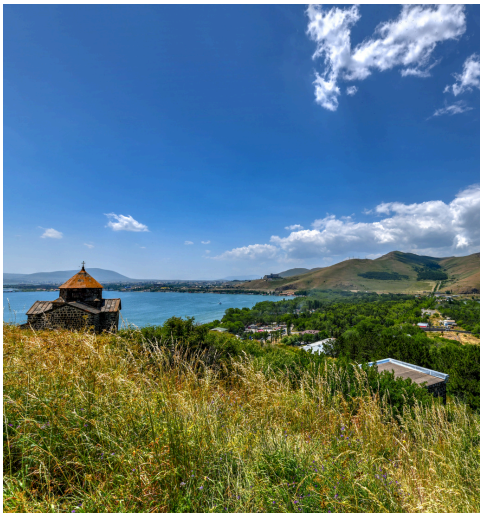
Armenia LAKE SEVAN 塞凡湖