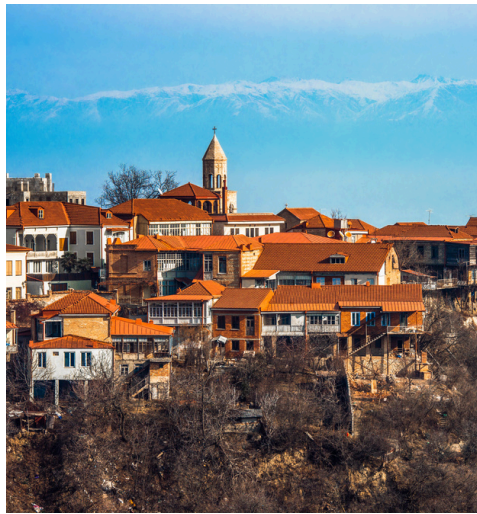
Kakheti, Georgia SIGNAGHI 锡格纳赫