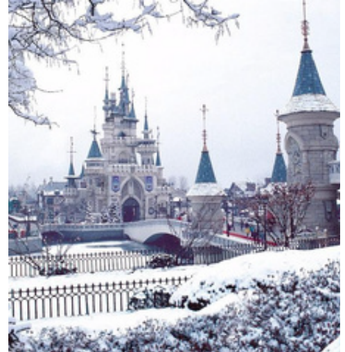
Seoul LOTTE WORLD THEME PARK 乐天世界