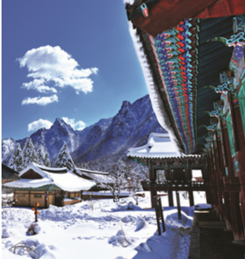
Gangwon-do SEORAKSEN SINHEUNGSA 神兴寺