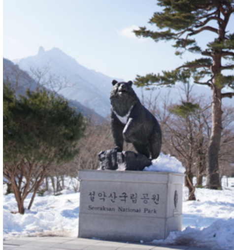
Seoul SEORAKSAN NATIONAL PARK 雪岳山国立公园