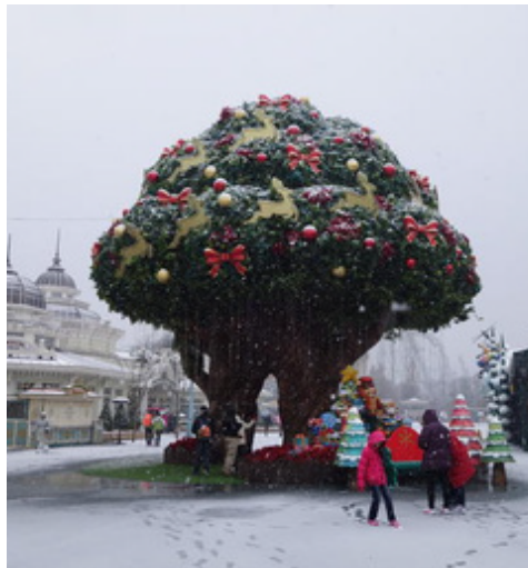
Yongin EVERLAND THEME PARK 爱宝乐园