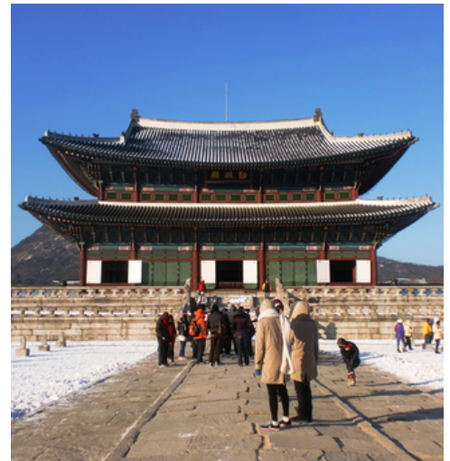
Seoul GYEONGBOKGUNG PALACE 景福宫

For reservations or any other inquiries, please contact our staff.