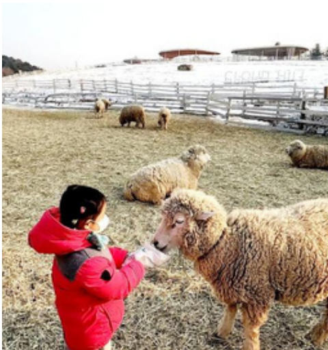
Gangwon-do GAPYEONG SHEEP FARM 加平羊牧场+草泥马