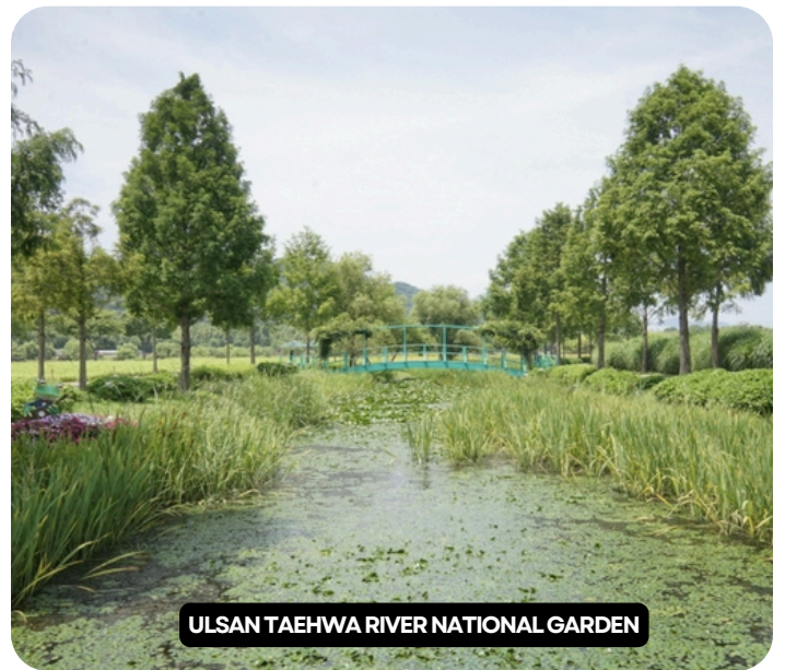
ULSAN TAEHWA RIVER NATIONAL GARDEN