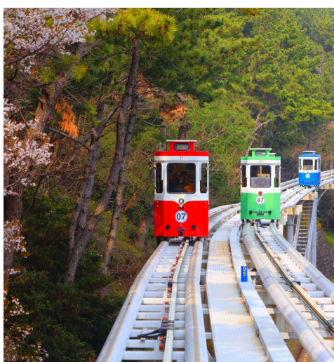
SKY CAPSULE TRAIN 天空胶囊列车