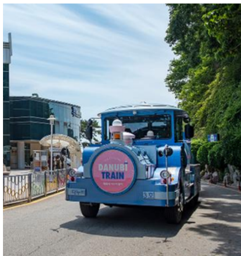
TAEJONGDAE DANUBI TRAIN 太宗台达努比列车