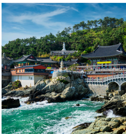
HAEDONG YONGGUNGSA TEMPLE 海东龙宫寺