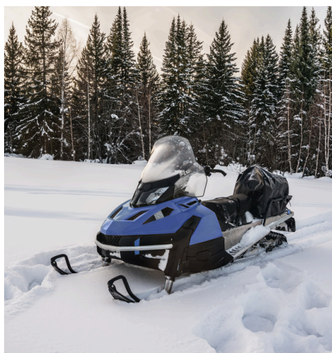
Saariselkä, Finland SNOWMOBILE RIDE 雪地摩托车骑行