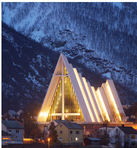
Tromsø, Norway ARCTIC CATHEDRAL 北极大教堂