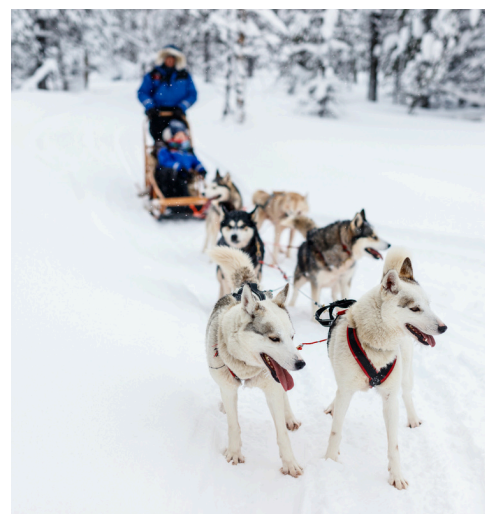
Rovaniemi, Finland HUSKY DOG RIDE 哈士奇狗拉雪橇

For reservations or any other inquiries, please contact our staff.