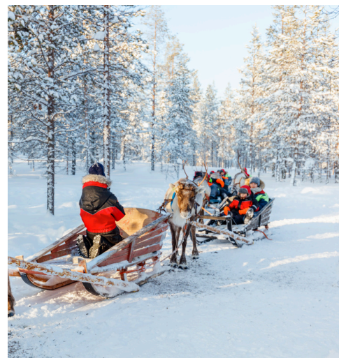
Rovaniemi, Finland REINDEER RIDE 驯鹿骑行