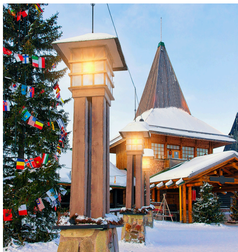
Rovaniemi, Finland SANTA CLAUSE VILLAGE 圣诞老人村