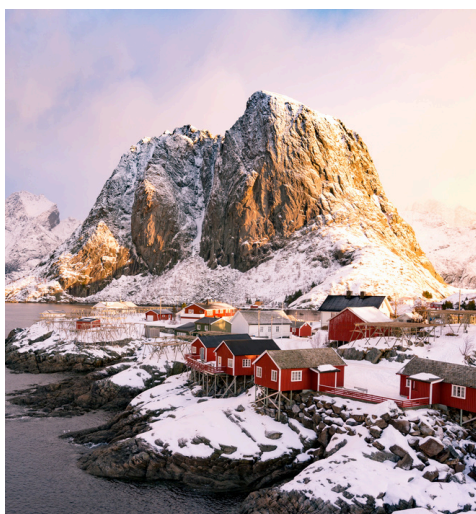
Lofoten, Norway LOFOTEN ISLAND 洛弗敦岛