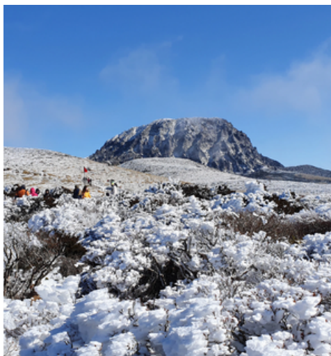
Jeju SEONGSAN ILCHULBONG 城山日出峰