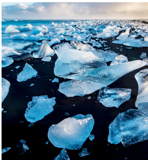
Jökulsárlón, Iceland DIAMOND BEACH 钻石沙滩