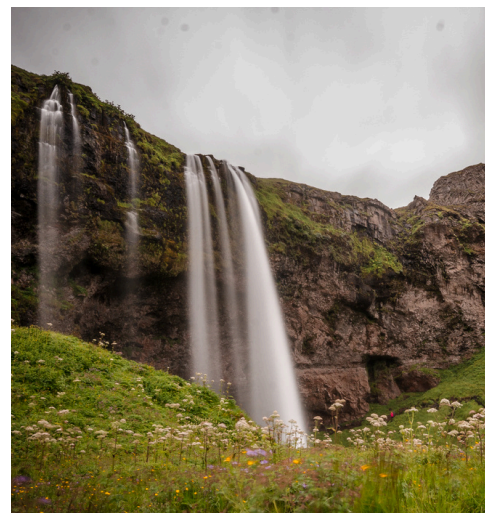
South Coast, Iceland SELJALANDSFOSS 塞利亚兰瀑布