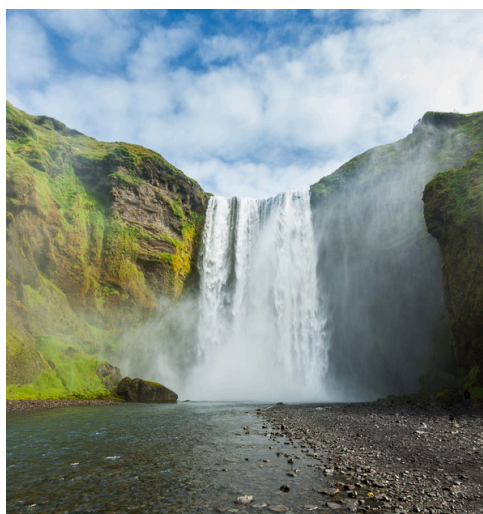
Skogafoss, Iceland SKOGAFOSS 斯科加瀑布