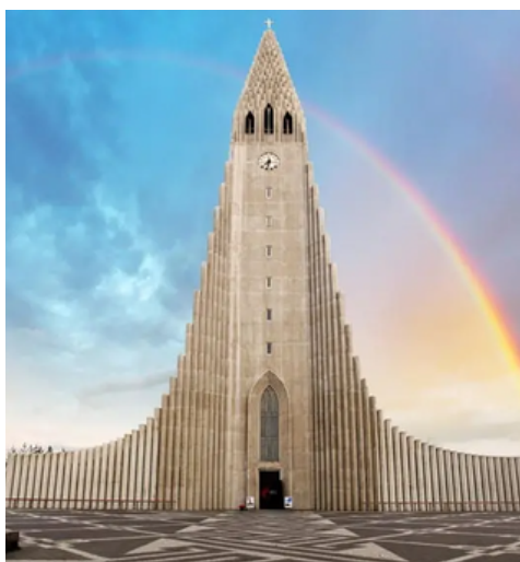
Reykjavik, Iceland HALLGRIMSKIRKJA 哈尔格林姆斯教堂