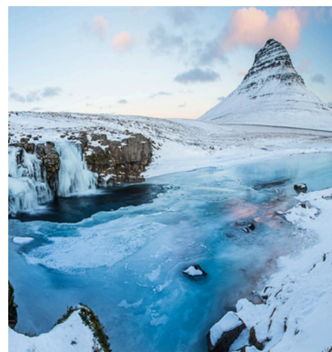
Reykjavik, Iceland SNÆFELLSJÖKULL NATIONAL PARK 斯奈山国家公园

For reservations or any other inquiries, please contact our staff.