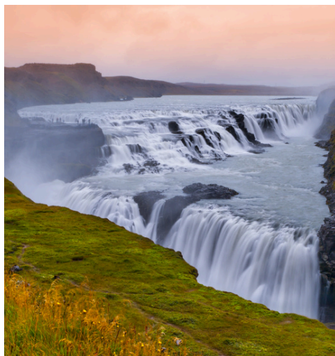
Golden Circle, Iceland GULFOSS WATERFALL 黄金瀑布