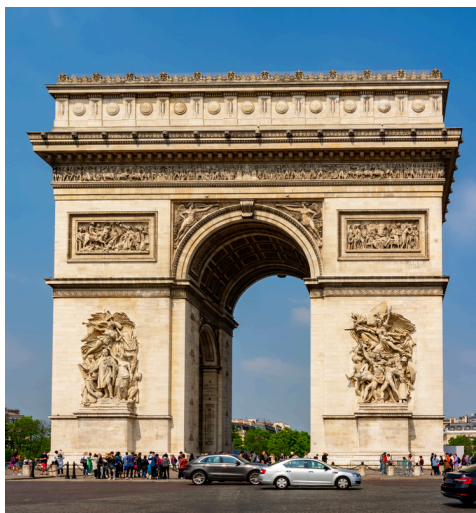
Paris, France ARC DE TRIOMPHE 凯旋门