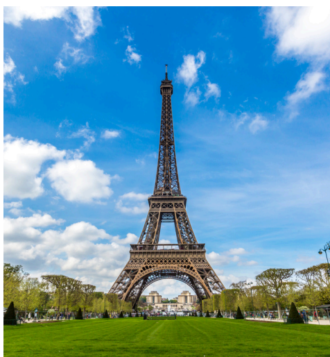
Paris, France EFFIEL TOWER 埃菲尔铁塔