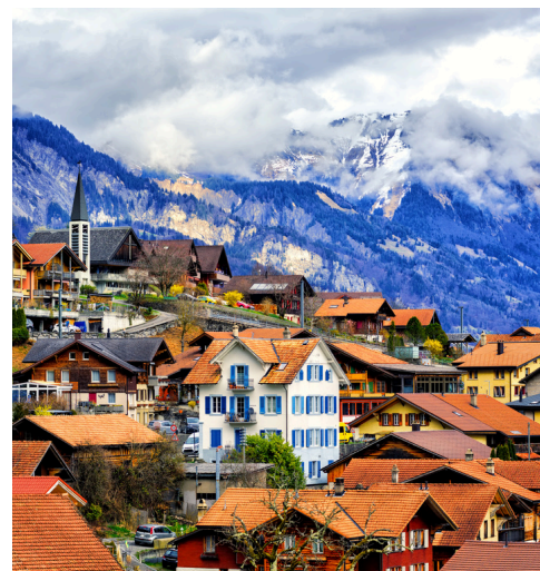
Interlaken, Switzerland INTERLAKEN TOWN 因特拉肯镇