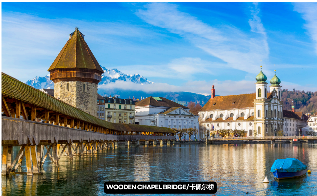
WOODEN CHAPEL BRIDGE / 卡佩尔桥

Disclaimer: Due to travel restrictions related to the COVID-19 pandemic, local religious holidays, public holidays, weather conditions, transportation, natural disasters, or other unforeseen circumstances, SEARCH TRAVEL reserves the right to make necessary adjustments to the itinerary (including changes in the order of sightseeing) to ensure the smooth progress of the trip, with or without prior notice. Please note that if the travel itinerary is affected by the aforementioned issues, refunds or replacements will not be provided. Images are for reference only. In case of any discrepancies between the Chinese and English versions of the itinerary, the English version shall prevail.