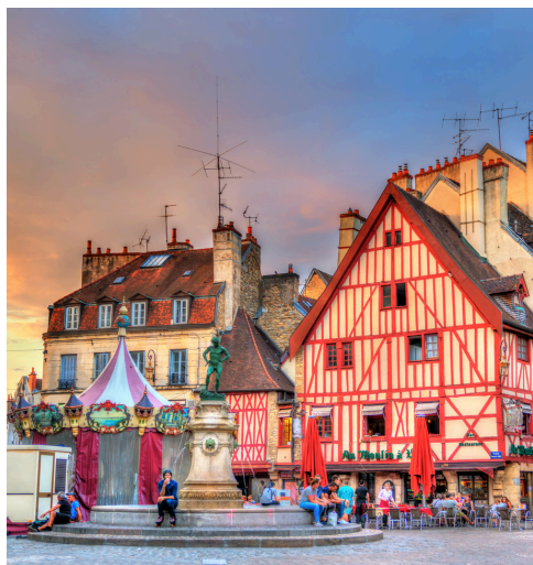
Dijon, France OLD TOWN OF DIJON 第戎古城区