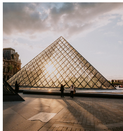
Paris, France LOUVRE MUSEUM 卢浮宫

For reservations or any other inquiries, please contact our staff.