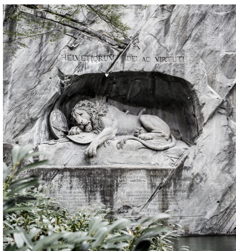
Lucerne, Switzerland LION MONUMENT 狮子纪念碑