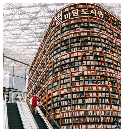
THE STARFIELD LIBRARY COEX 星空图书馆

For reservations or any other inquiries, please contact our staff.