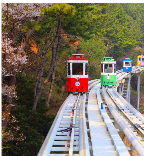
SKY CAPSULE TRAIN 天空胶囊列车