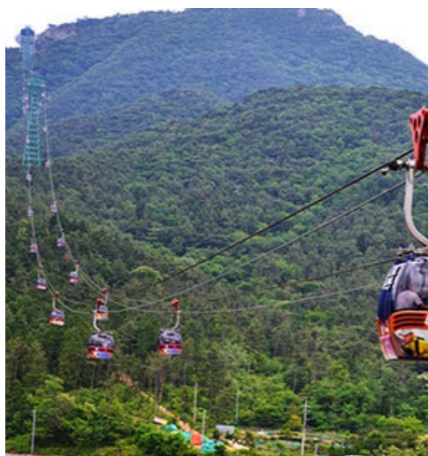
TONGYEONG CABLE CAR 统营缆车