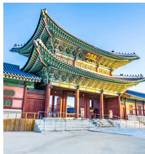
GYEONGBOKGUNG PALACE 景福宫