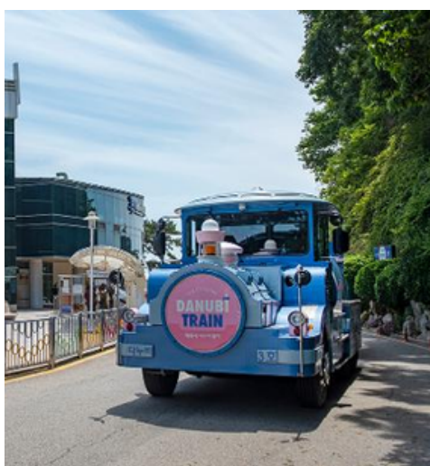
TAEJONGDAE DANUBI TRAIN 太宗台达努比列车