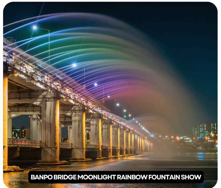
BANPO BRIDGE MOONLIGHT RAINBOW FOUNTAIN SHOW