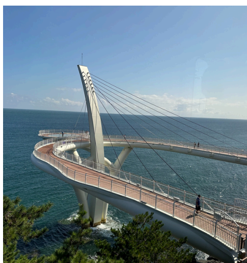
CHEONGSAPO SKYWALK 青沙浦天空步道