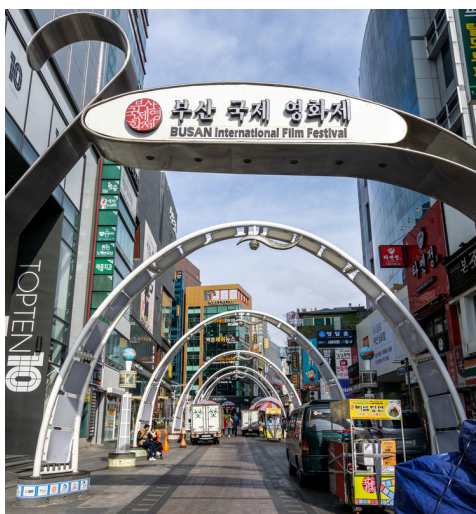
Busan BIFF SQUARE BIFF广场