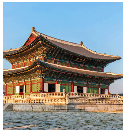
Seoul GYEONGBOKGUNG PALACE 景福宫

For reservations or any other inquiries, please contact our staff.