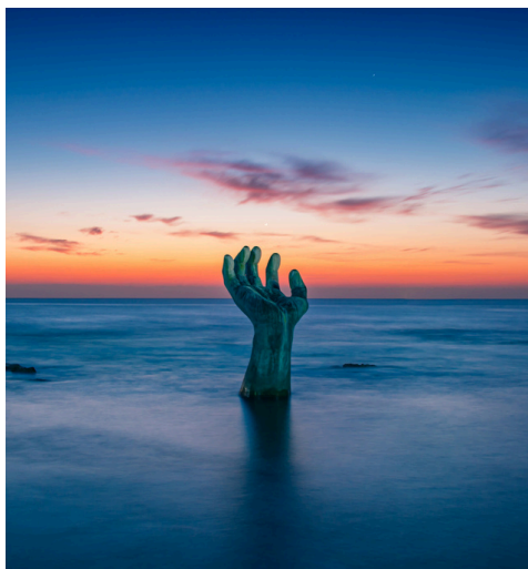
Pohang HOMIGOT SUNRISE SQUARE 虎尾岬迎日广场