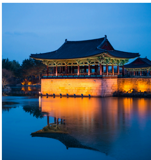
Gyeongju DONGGUNG PALACE 东宫