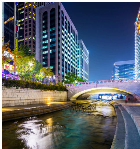
Seoul CHEONGGYEcheon STREAM 清溪川