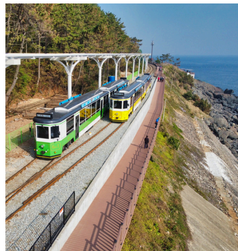
Busan HAEUNDAE BEACH TRAIN 海云台海岸列车