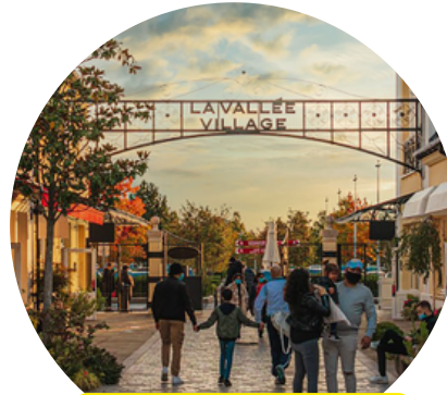
La Vallee Village