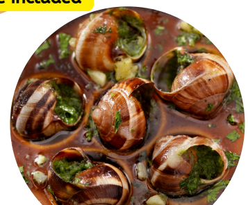
French Dinner with Wine Included