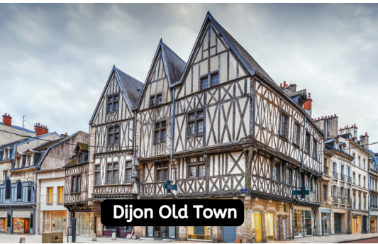
Dijon Old Town