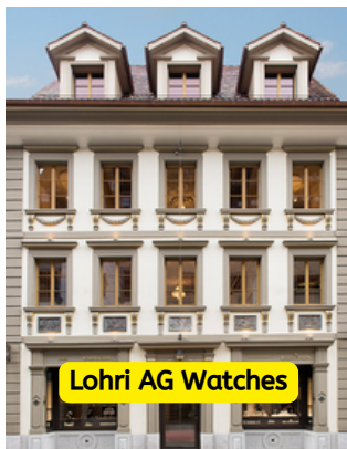
Lohri AG Watches