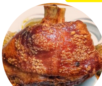
Pork Knuckle Lunch Included