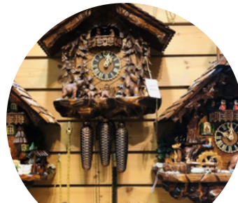
Cuckoo Clock Centre Included