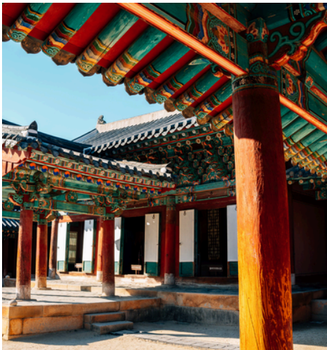
Jeonju GYEONGGIJEON 庆基殿