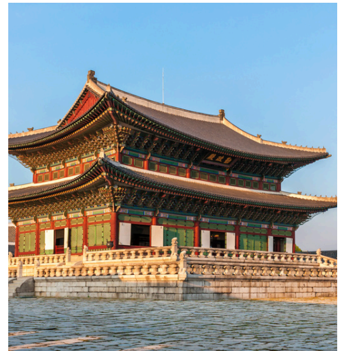
Seoul GYEONGBOKGUNG PALACE 景福宫

For reservations or any other inquiries, please contact our staff.