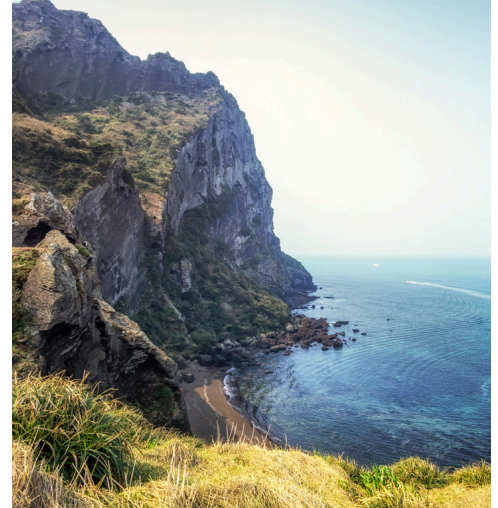
Jeju SEONGSAN ILCHULBONG PEAK 城山日出峰