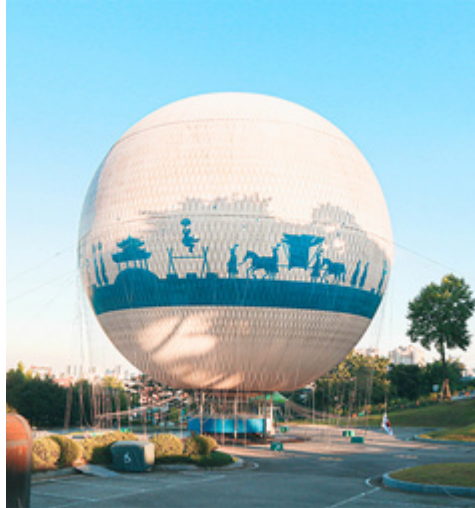
Seoul FLYING SUWON-HOT AIR BALLOON 热气球