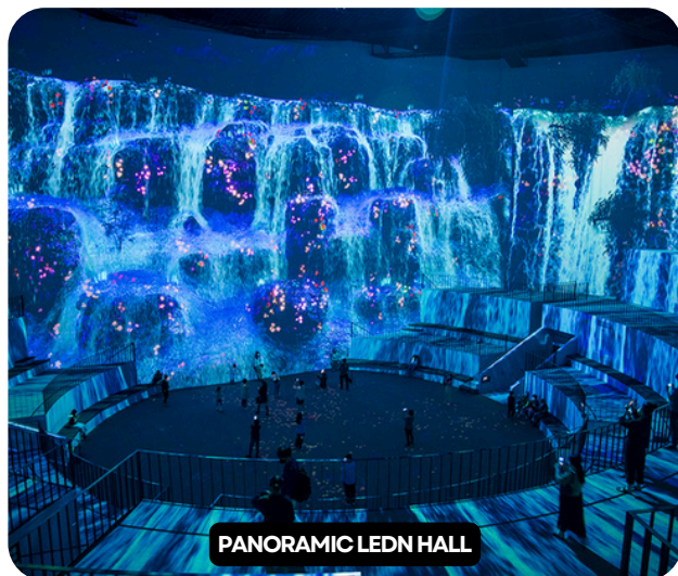
PANORAMIC LEDN HALL