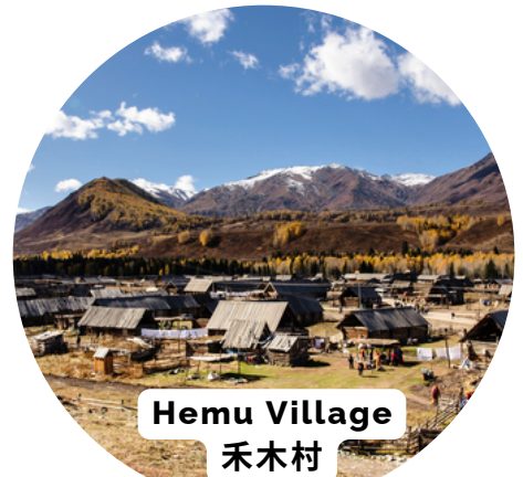
Hemu Village 禾木村