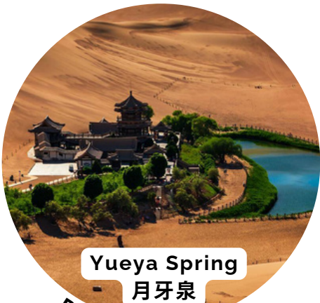
Yueya Spring 月牙泉