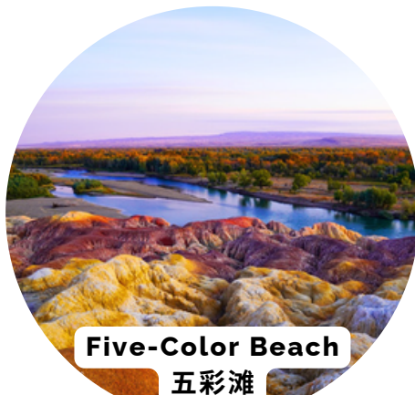
Five-Color Beach 五彩滩