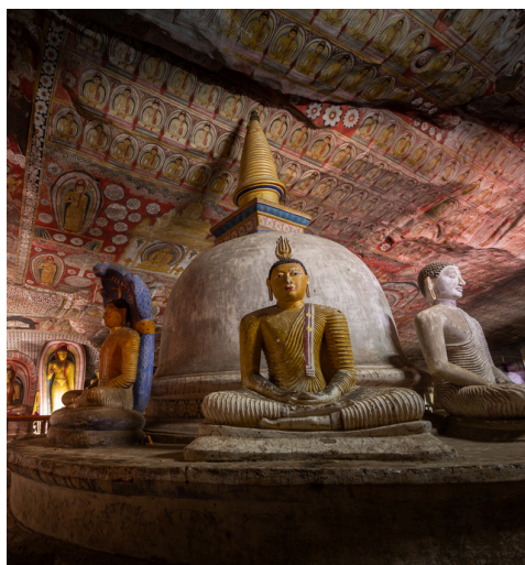
Dambulla, Sri Lanka CAVE TEMPLES 洞窟寺庙