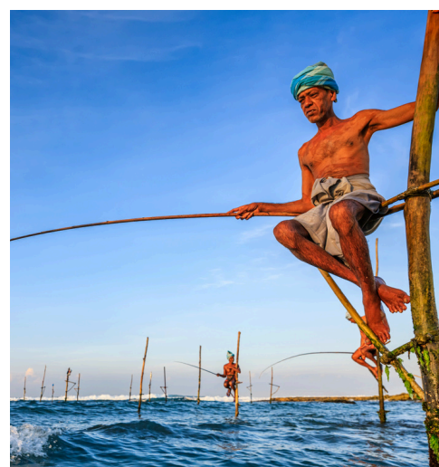
Sri Lanka FISHERMEN ON STILTS 高跷渔民

For reservations or any other inquiries, please contact our staff.