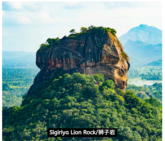
Sigiriya Lion Rock/狮子岩