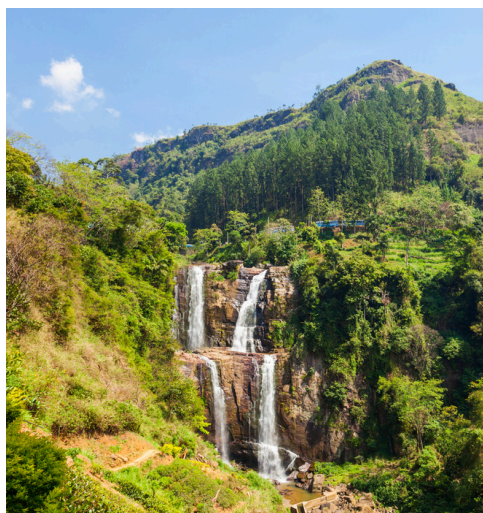
Sri Lanka RAMBODA WATERFALLS 兰博达瀑布