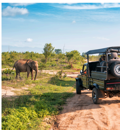
Yala, Sri Lanka NATIONAL PARK 雅拉国家公园