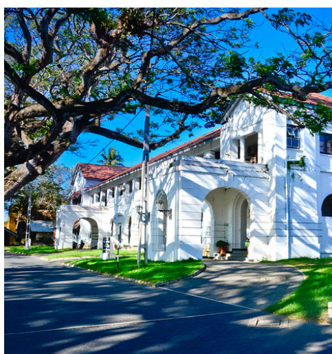
Galle, Sri Lanka THE DUTCH FORT 杰尔巴街头艺术