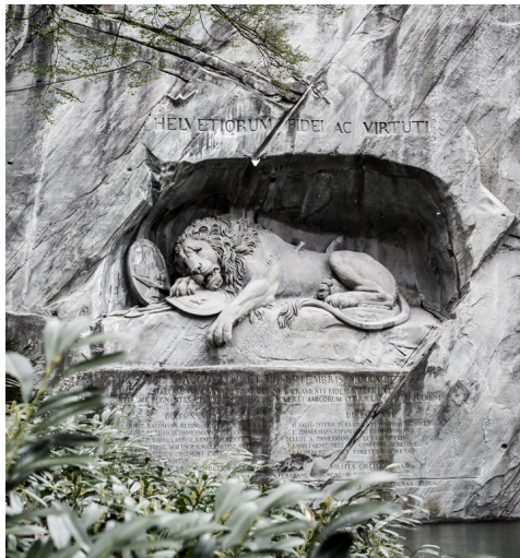
Lucerne, Switzerland LION MONUMENT 狮子纪念碑