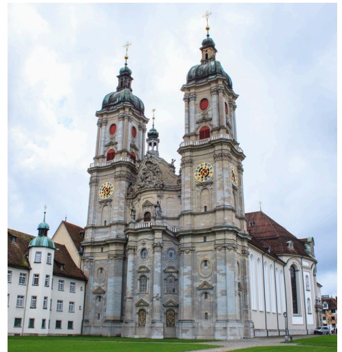
St. Gallen, Switzerland ST. GALLEN CATHEDRAL 圣加仑大教堂

For reservations or any other inquiries, please contact our staff.