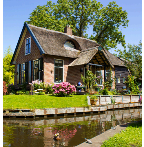
Giethoorn, Netherlands GIETHOORN 羊角村