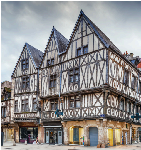
Dijon, France DIJON OLD TOWN 第戎老城