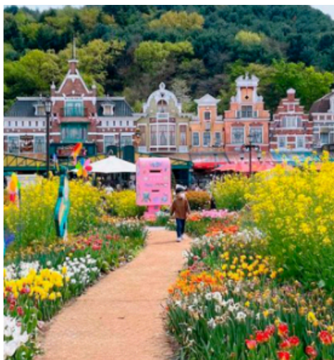
Seoul EVERLAND 爱宝乐园