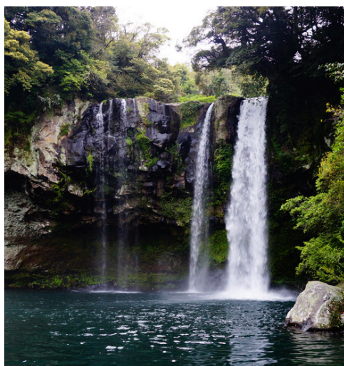
Jeju CHEONJIYEON WATERFALL 天地渊瀑布