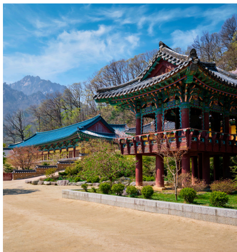
Gangwon-Do SEORAKSAN NATIONAL PARK 雪岳山国立公园