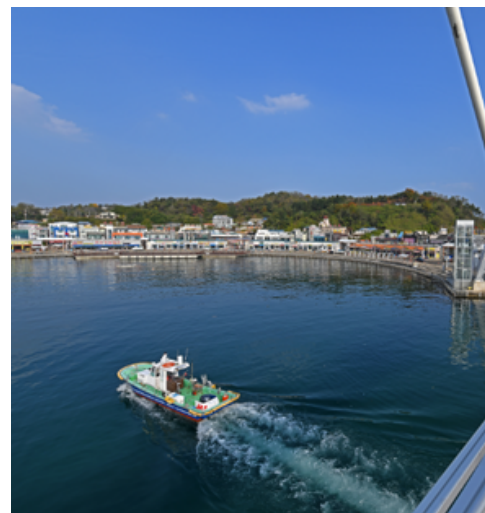
Gangwon-Do DAEPOHANG FISHING PORT 大浦渔港