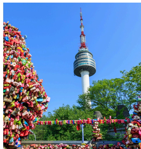
Seoul NAMSAN SEOUL TOWER N首尔塔

For reservations or any other inquiries, please contact our staff.