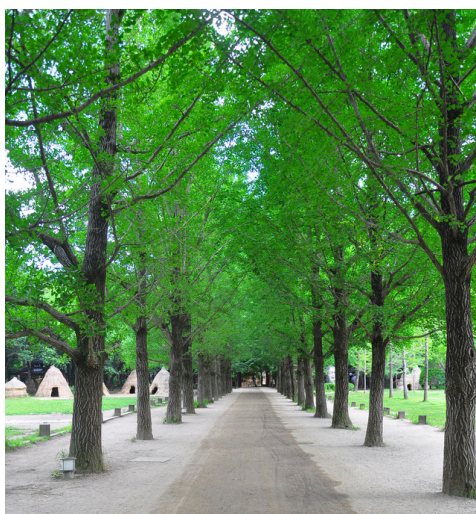
Gangwon-Do NAMI ISLAND 南怡岛