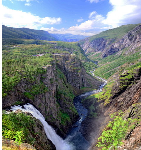
Edifjord, Norway VORINGFOSSEN 沃林瀑布