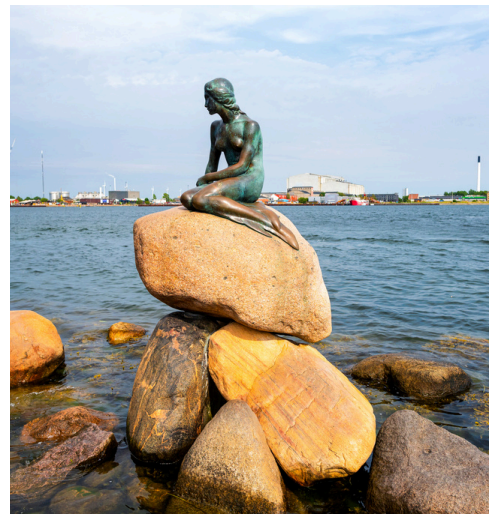
Copenhagen, Denmark LITTLE MERMAID 小美人鱼雕像

For reservations or any other inquiries, please contact our staff.