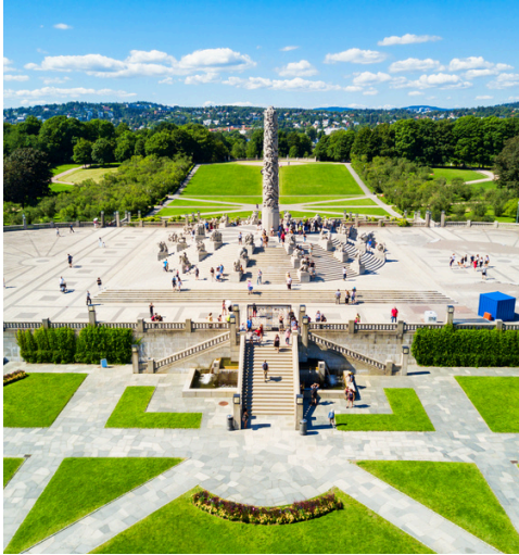
Oslo, Norway VIGELAND PARK 维格兰雕塑公园