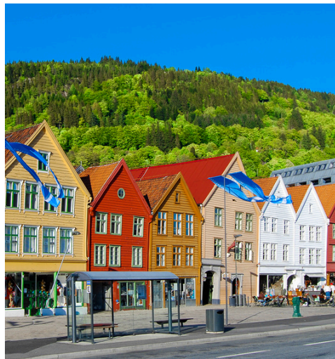
Bergen, Norway BRYGGEN 卑尔根码头