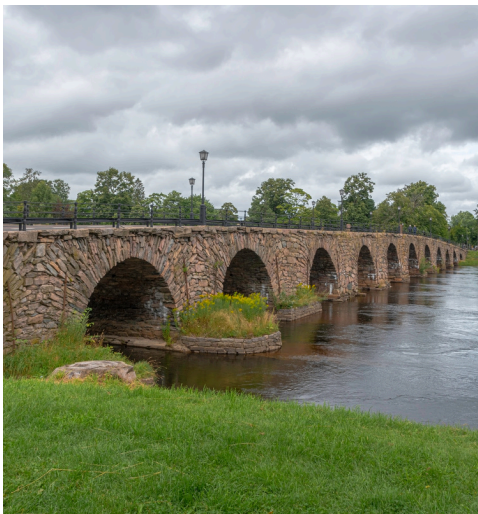
Karlstad, Sweden OLD STONE BRIDGE 老石桥