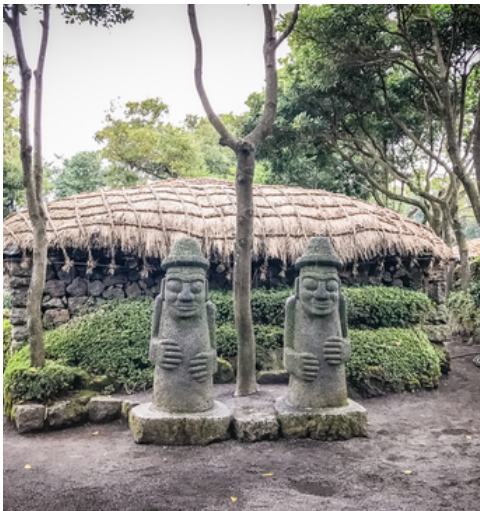
Jeju SEONGEUP FOLK VILLAGE 城邑民俗村