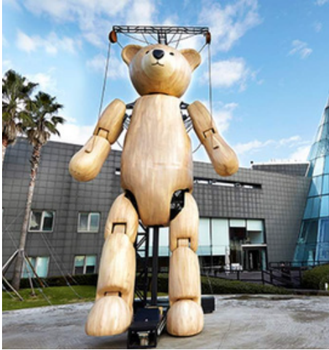
Jeju TEDDY BEAR MUSEUM 泰迪熊博物馆