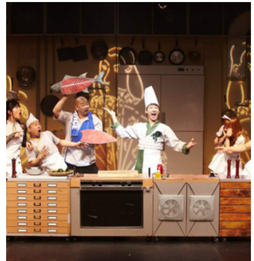
Seoul BIBIMBAP SHOW 拌饭秀

For reservations or any other inquiries, please contact our staff.