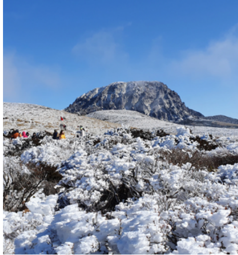
Jeju SEONGSAN ILCHULBONG 城山日出峰