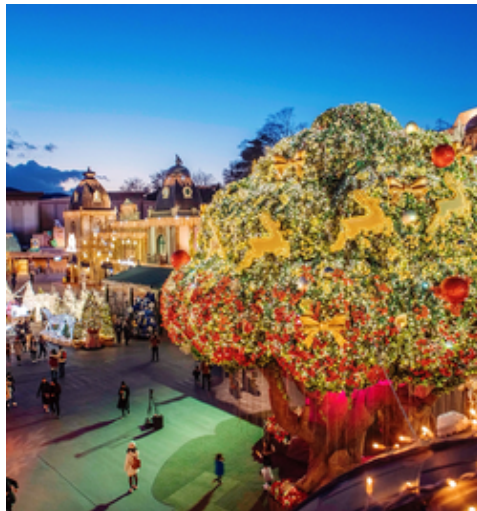
Yongin EVERLAND THEME PARK 爱宝乐园