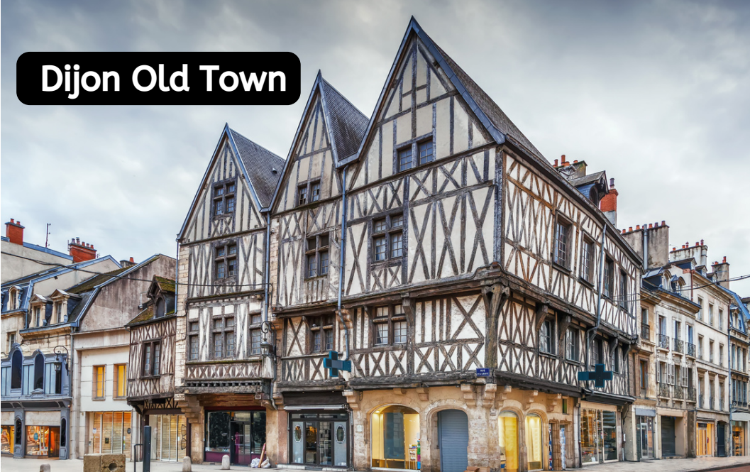
Dijon Old Town