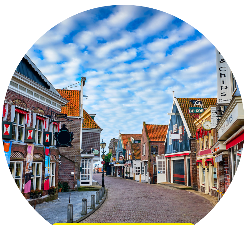
Optional Tour to Volendam