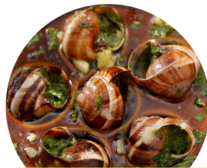
French Dinner with Wine Included