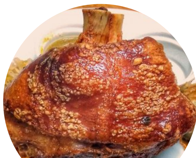
Pork Knuckle Lunch Included