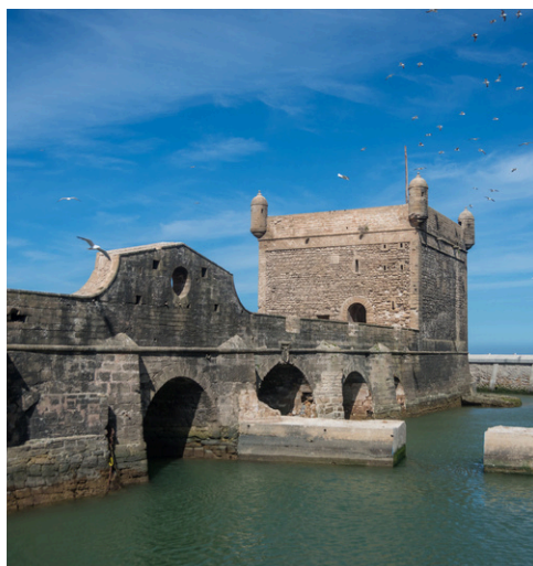
Essaouira, Morocco SQALA DU PORT 斯卡拉港口