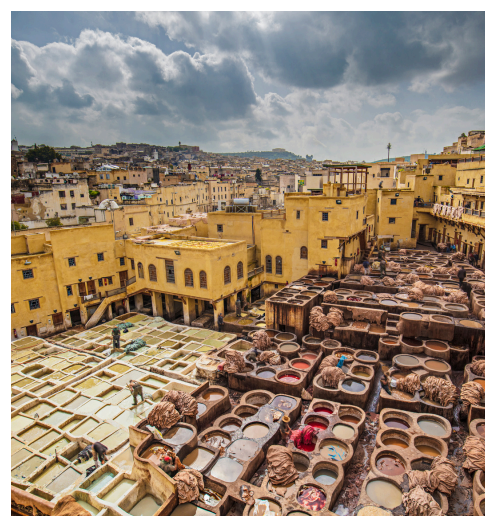
Fez, Morocco TANNERY 制革厂

For reservations or any other inquiries, please contact our staff.