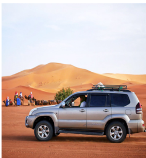
Merzouga, Morocco MERZOUGA DUNES 梅尔祖卡沙丘