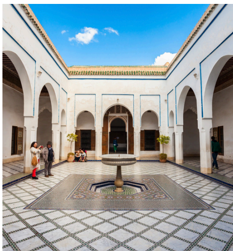
Marrakech, Morocco BAHIA PALACE 巴伊亚宫