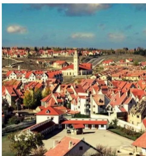
Irfane, Morocco IFRANE 伊夫兰