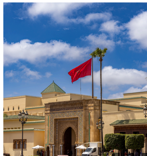
Rabat, Morocco ROYAL PALACE 皇家宫殿