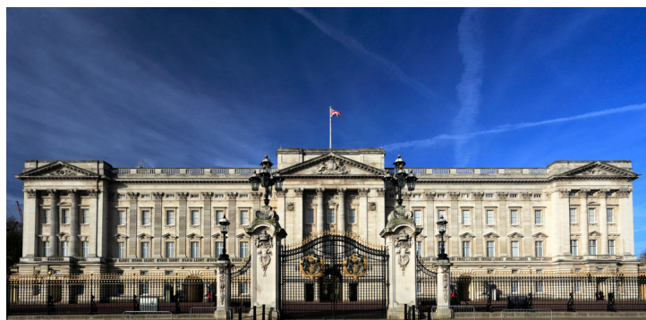
London, England BUCKINGHAM PALACE 白金汉宫