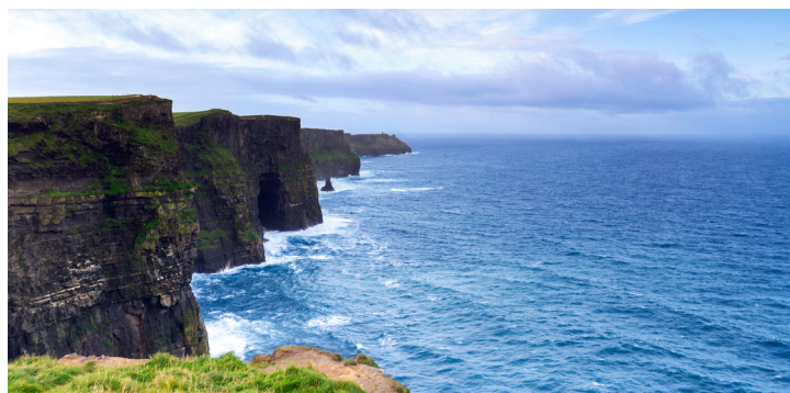
County Clare, Ireland CLIFFS OF MOHER 莫赫悬崖

For reservations or any other inquiries, please contact our staff.