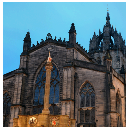
Edinburgh, Scotland ST. GILES CHURCH 圣吉尔斯教堂