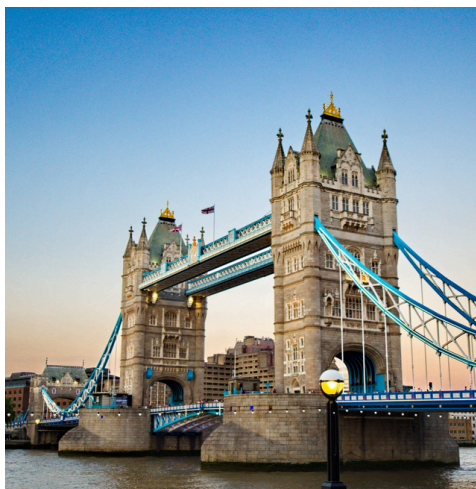
London, England TOWER BRIDGE 塔桥