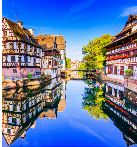
Strasbourg, France OLD TOWN 老城区