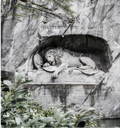
Lucerne, Switzerland LION MONUMENT 狮子纪念碑