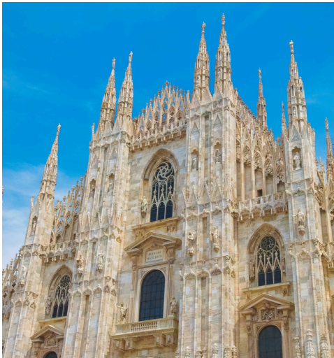
Milan, Italy MILAN DUOMO 米兰大教堂