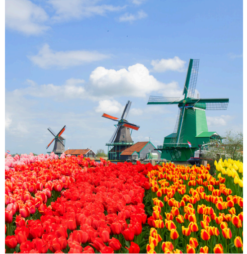
Amsterdam, Netherlands ZAANSE SCHANS 桑斯安斯风车村