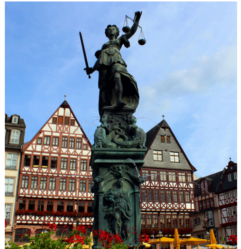
Frankfurt, Germany OLD TOWN 老城区

For reservations or any other inquiries, please contact our staff.