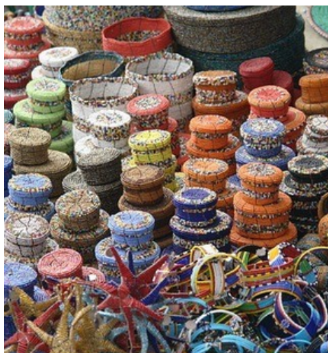
Nairobi, Kenya COLORFUL MARKET 色彩斑斓的市场