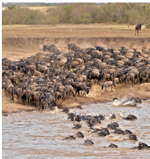
Masai Mara, Kenya MARA RIVER 马拉河