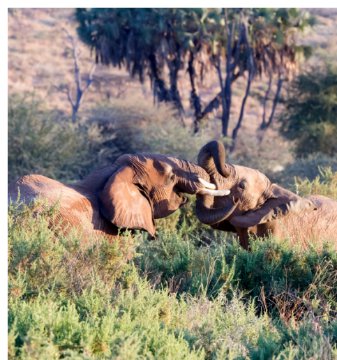
Samburu, Kenya SAMBURU NATIONAL PARK 桑布鲁国家公园

For reservations or any other inquiries, please contact our staff.