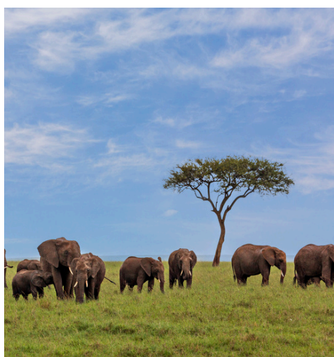
Masai Mara, Kenya MASAI MARA NATIONAL PARK 马赛马拉国家公园