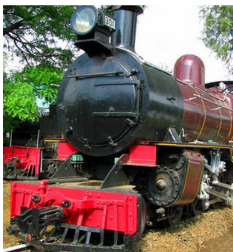
Nairobi, Kenya RAILWAY MUSEUM 铁路博物馆