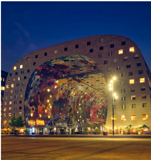
Rotterdam, Netherlands MARKTHAL 马克塔尔市场