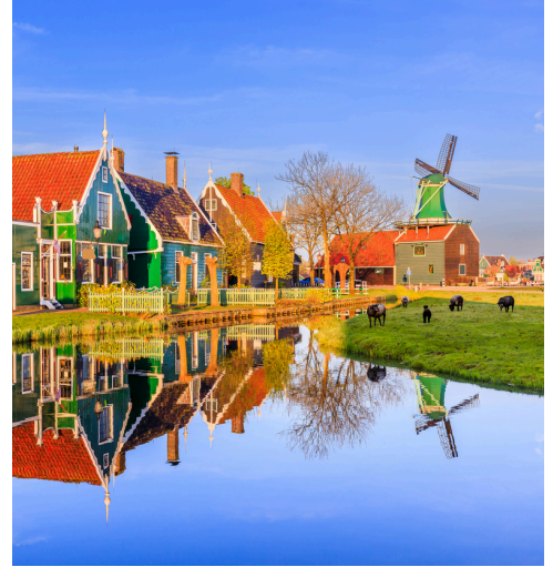
Amsterdam, Netherlands ZAANSE SCHANS 扎恩塞·斯汉斯