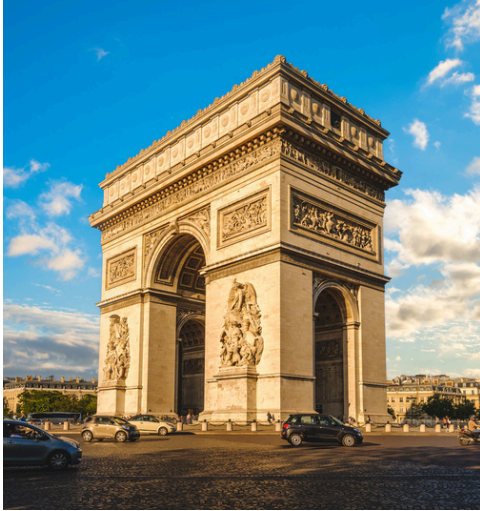
Paris, France ARC DE TRIOMPHE 凯旋门