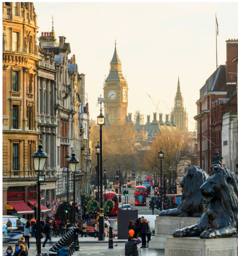
London, England TRAFALGAR SQUARE 特拉法加广场