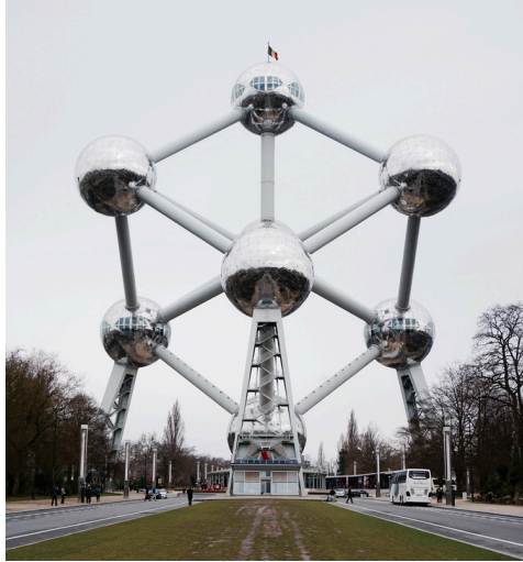
Brussels, Belgium ATOMIUM 原子球塔