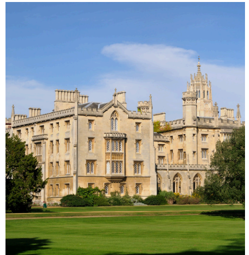
Cambridge, England ST JOHN'S COLLEGE 圣约翰学院

For reservations or any other inquiries, please contact our staff.