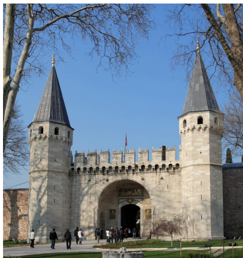
Istanbul, Turkey TOPKAPI PALACE 托普卡帕宫