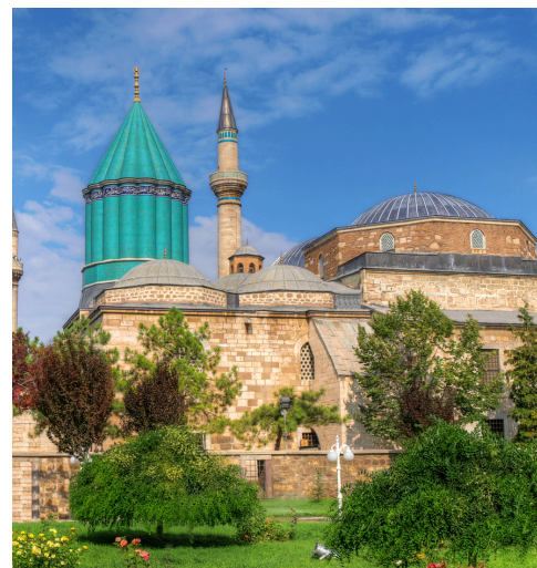
Konya, Turkey MEVLANA MUSEUM 梅乌拉那博物馆