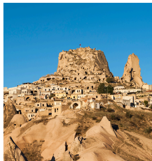
Cappadocia, Turkey UCHISAR CASTLE 乌奇萨尔城堡

For reservations or any other inquiries, please contact our staff.