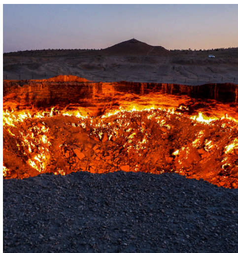
Darvaza (Turkmenistan) DARVAZA GAS CRATER 达尔瓦扎燃气坑