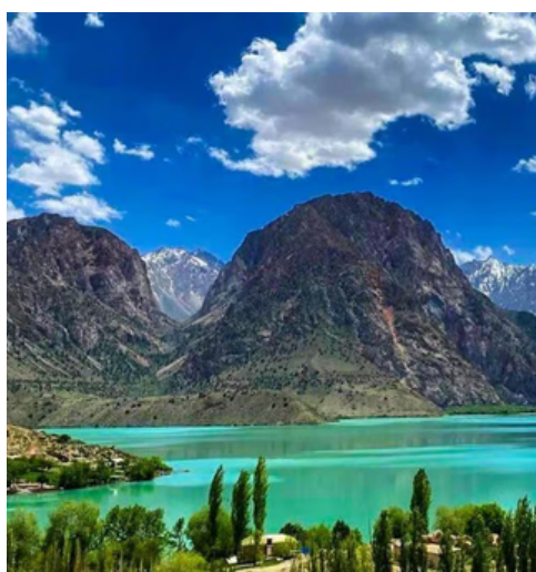
Dushanbe (Tajikistan) ISKANDARKUL LAKE 伊斯坎德尔湖