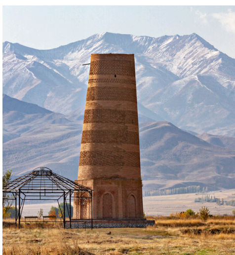
Tokmok (Kyrgyzstan) BURANA TOWER 布拉纳塔