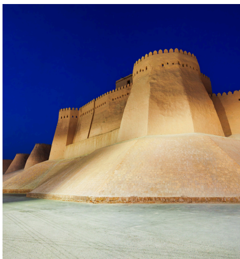
Khiva (Uzbekistan) KUNYA ARK FORTRESS 库尼亚城堡