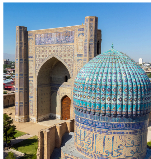
Samarkand (Uzbekistan) BIBI KHANYM MOSQUE 比比·哈努姆清真寺