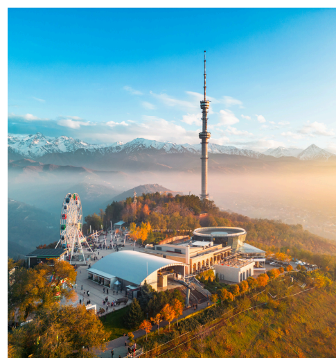
Almaty (Kazakhstan) ALMATY TV TOWER 阿拉木图电视塔

For reservations or any other inquiries, please contact our staff.