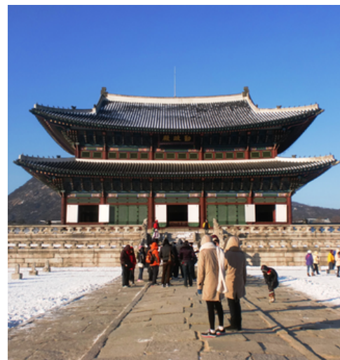
Seoul GYEONGBOKGUNG PALACE 景福宫