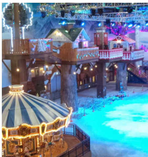
Jeju SUMOKWON THEME PARK 树木园主题公园