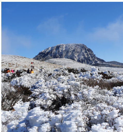
Jeju SEONGSAN ILCHULBONG 城山日出峰