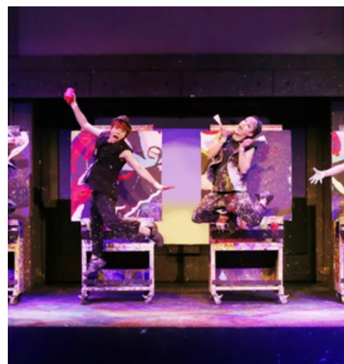
Seoul THE PAINTERS: HERO HERO涂鸦秀

For reservations or any other inquiries, please contact our staff.