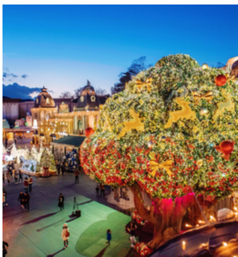
Yongin EVERLAND THEME PARK 爱宝乐园