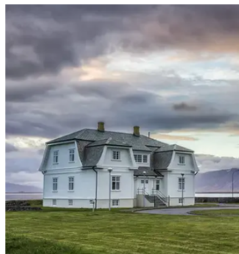
Reykjavik, Iceland HÖFÐI HOUSE 霍夫迪之家

For reservations or any other inquiries, please contact our staff.