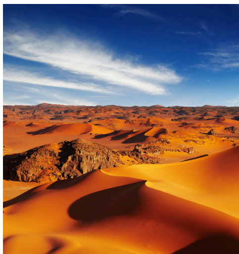
Tunisia SAHARA DESSERT 撒哈拉沙漠