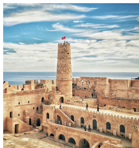
Monastir, Tunisia MONASTIR'S RIBAT 蒙斯特尔的里巴特

For reservations or any other inquiries, please contact our staff.