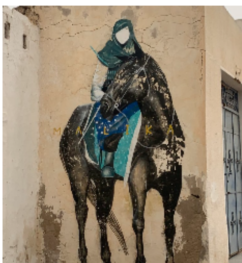
Djerba, Tunisia DJERBAHOOD 杰尔巴街头艺术