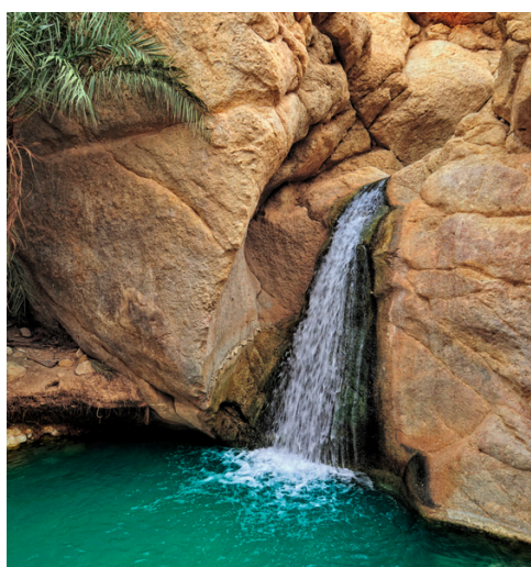
Tunisia CHEBIKA OASIS 马赛马拉国家公园