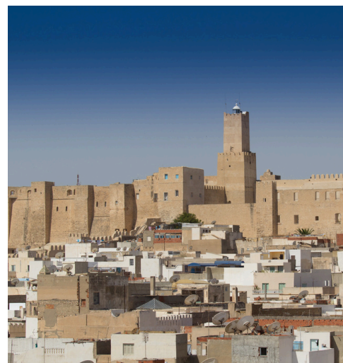
Sousse, Tunisia SOUSSE MEDINA 苏塞麦地那