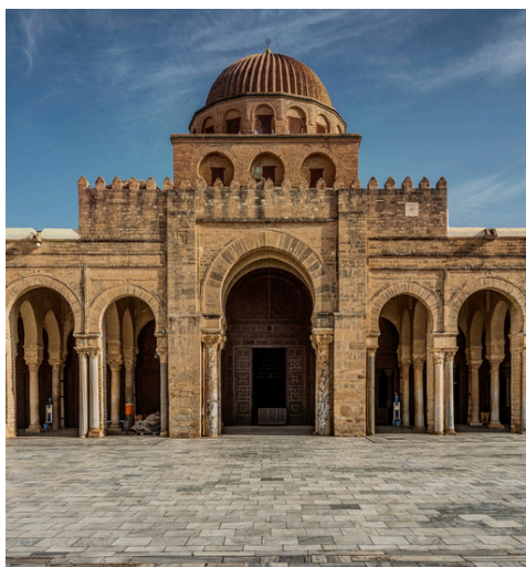
Kairouan, Tunisia KAIROUAN 凯鲁万