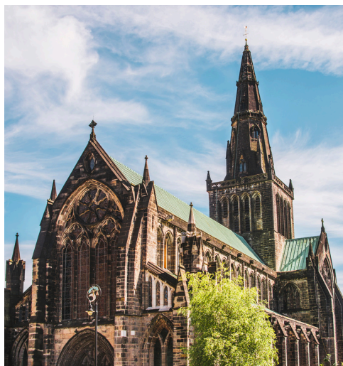
Glasgow, Scotland GLASGOW CATHEDRAL 格拉斯哥大教堂