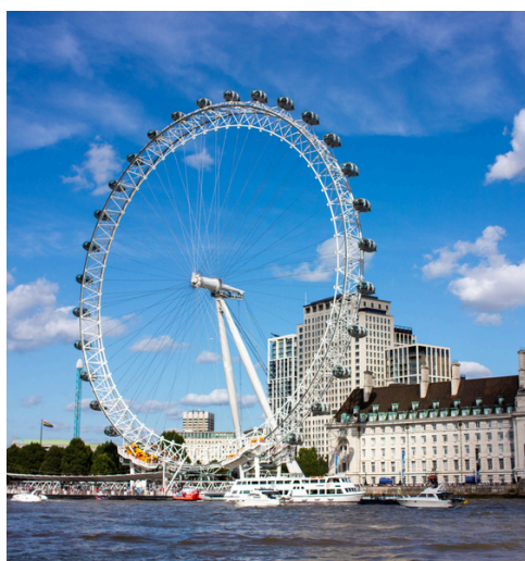
London, England LONDON EYE 伦敦眼