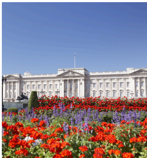
London, England BUCKINGHAM PALACE 白金汉宫