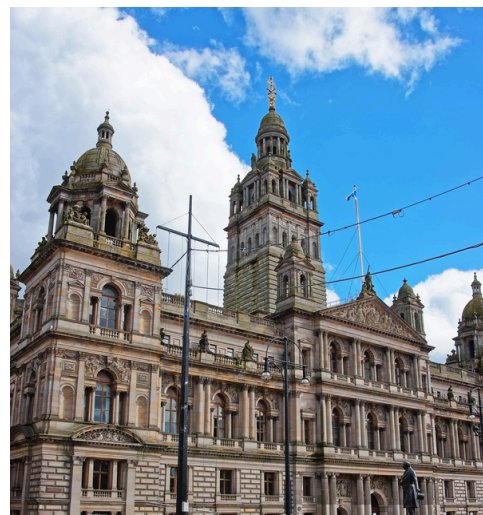
Glasgow, Scotland GEORGE SQUARE 乔治广场