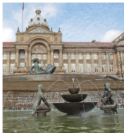
Birmingham, England VICTORIA SQUARE 维多利亚广场

For reservations or any other inquiries, please contact our staff.