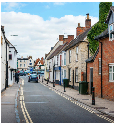
Bicester, England BICESTER VILLAGE 比斯特购物村