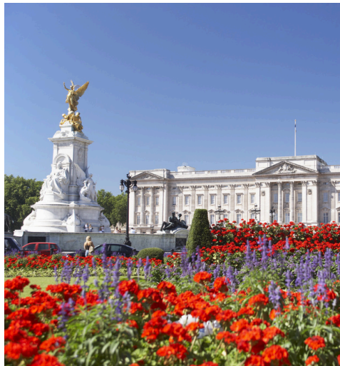
London, England BUCKINGHAM PALACE 白金汉宫